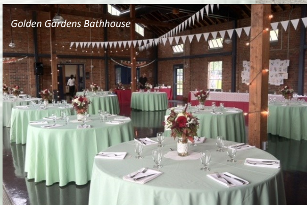
Golden Gardens Bathhouse