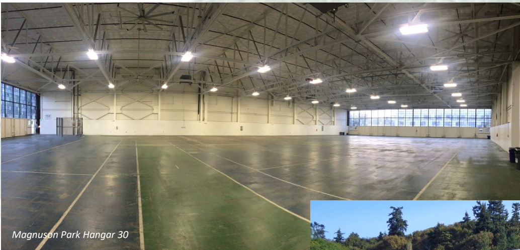
Magnuson Park Hangar 30