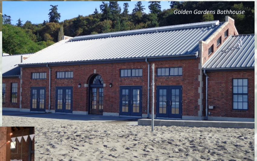
Golden Gardens Bathhouse